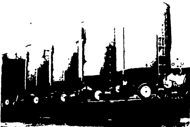
GT TOX-O-WIX® CONTINUOUS RECIRCULATING GRAIN DRYERS

HI-MOISTURE CORN PROBLEMS? GT Tox-o-Wix GRAIN DRYER WILL DRY CORN FOR PENNIES PER BUSHEL. Your Best Investment