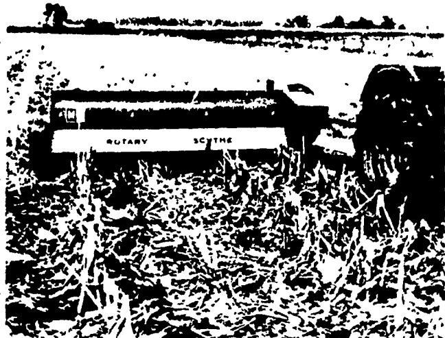
Does the work of five machines — mower, windrower, conditioner, rake, shredder.