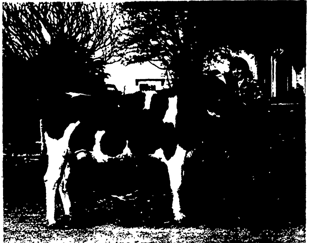
Showing his Holstein dairy animals at various shows this summer kept