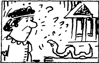
The Greeks believed that the soil of Lemnos cured snake-bite

This farmer would appreciate any information or ideas as to just what the cobs might have been used for or why they were kept for such a time. Please respond to Lancaster Farming.