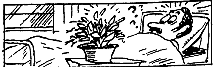
At one time, columbine leaves were considered a cure for jaundice and sore throat.

"Based on the data, and because swine dysentery is one of the most costly diseases to the swine industry, we expect FDA approval for this usage will be forthcoming," he says.