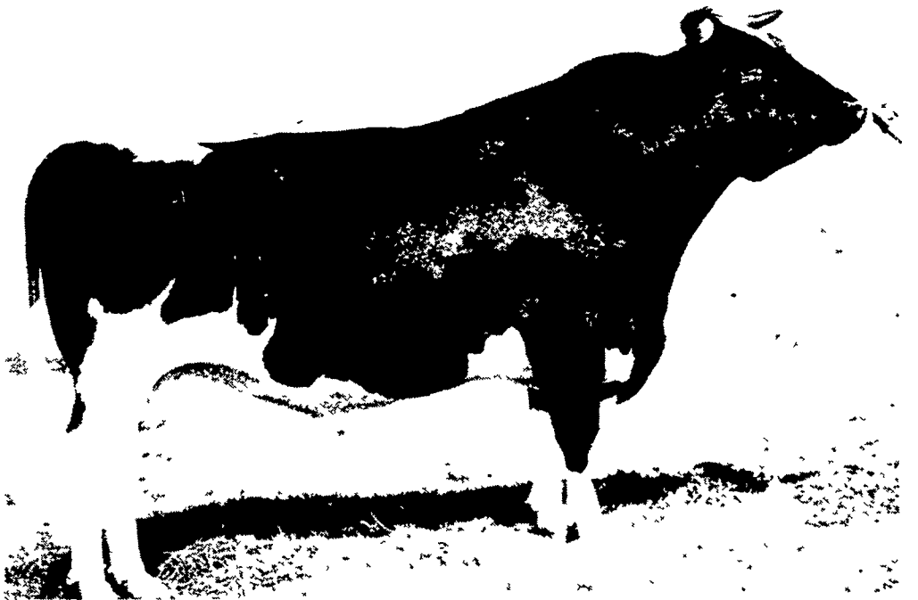
Viewing Bootmaker one of the most outstanding sires ever to be offered to cattlemen was one of the highlights