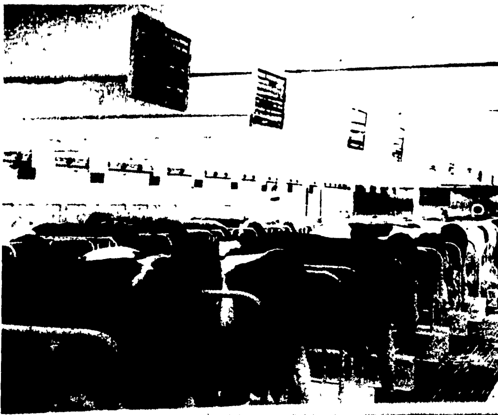
Select sires are housed in the main barn facilities at the DeForest Headquarters of the American Breeders Service. Also located in the

American Breeders Service not only sponsored an outstanding booth display