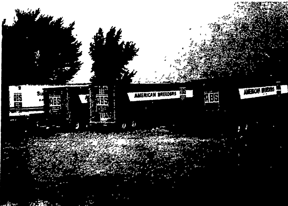
American Breeders Service has a fleet of trucks that work on regular schedule delivering ordered semen

and supplies to technicians across the country.