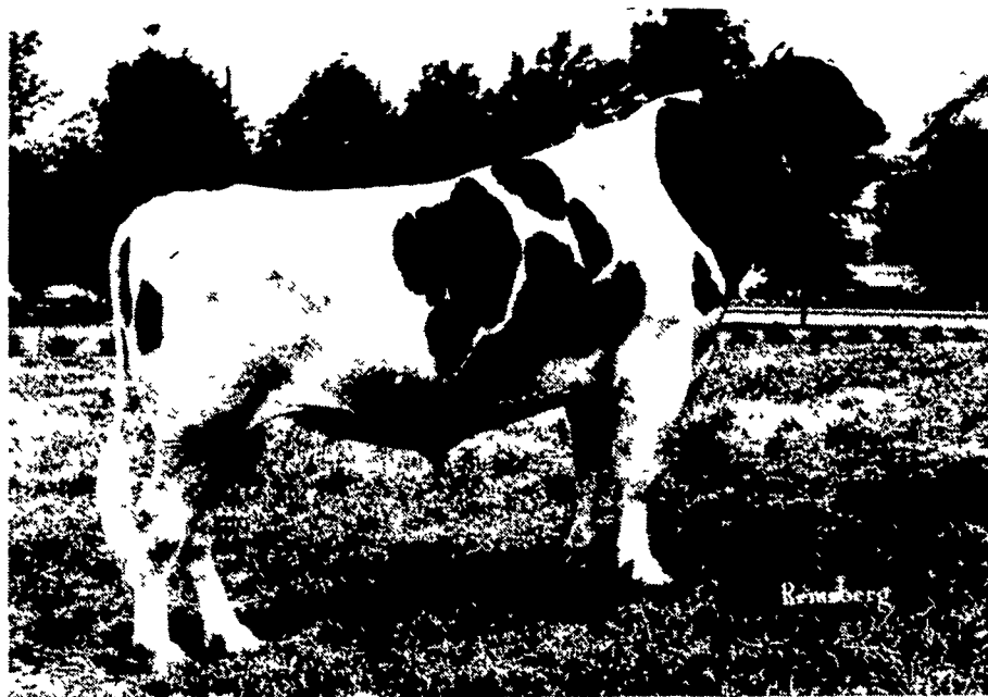
15H123 Whittier Farms Apollo ROCKET Good Plus & Production Qualified

These Plus-Proven Sires Are Available Daily For Your Dairy Herd: