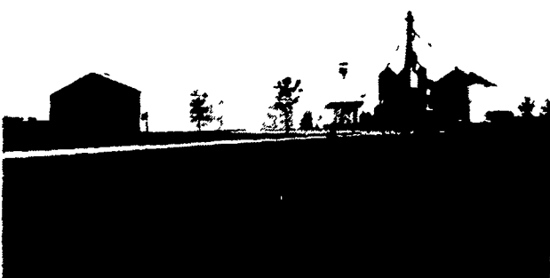
LARGE MACHINE SHED & SHOP