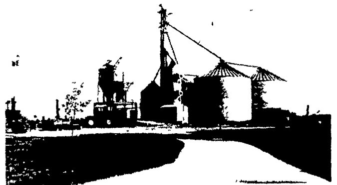
GRAIN STORAGE & DRYING FACILITY

Eighty Five Thousand bushel storage and Seven Thousand bushel per day drying facility. These facilities are ultra-modern and of the latest design.