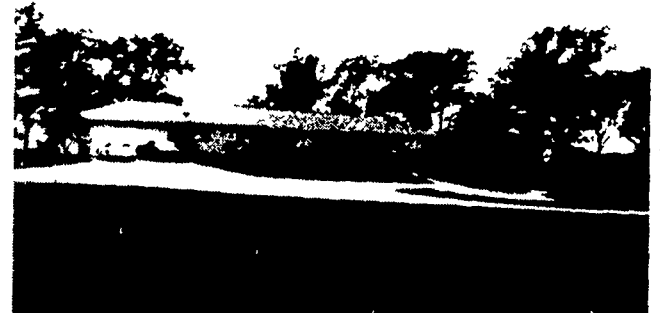
110' x 48' 2 LEVEL HOUSE