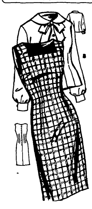
No 3369 - The popular a quickie here because it cuts just two major pattern pieces. Darts are strategically placed for better fit. No. 3369 comes in sizes 121/2 to 221/2 (bust 35 to 45) Size 141/2 (bust 37) takes 27/a yards of 35 inch blouse 23/4 yards of 35 inch