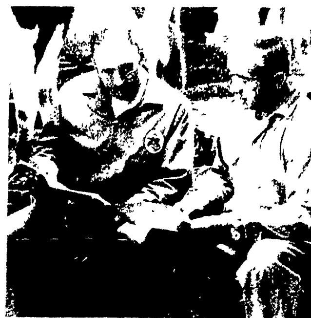
STEP 3: dairyman and Mate-Rite specialist discuss the chart and herd breeding goals to determine specific sires for each cow.