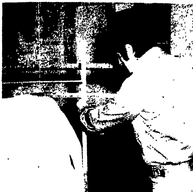
STEP 1: exact measurement of each cow and analysis of her major type weaknesses.