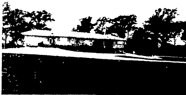
110' x 48' 2 LEVEL HOUSE