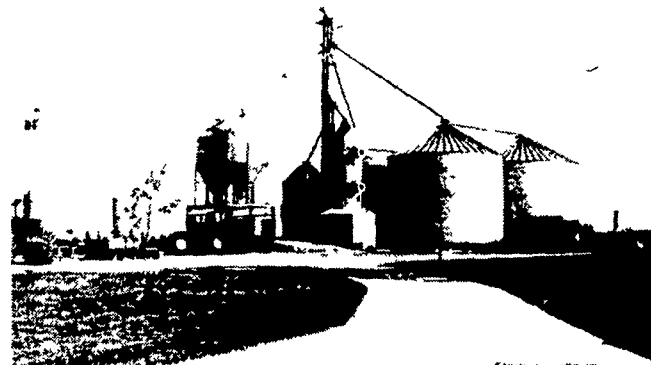
GRAIN STORAGE & DRYING FACILITY

Eighty Five Thousand bushel storage and Seven Thousand bushel per day drying facility. These facilities are ultra-modern and of the latest design.