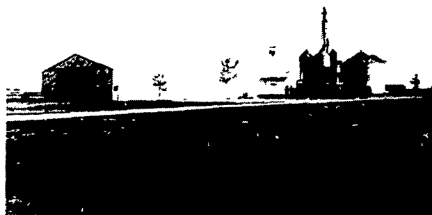
LARGE MACHINE SHED & SHOP