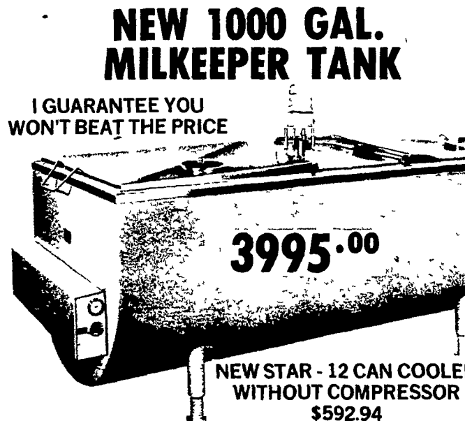
NEW 1000 GAL. MILKEPER TANK