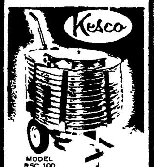
MODEL RSC 100