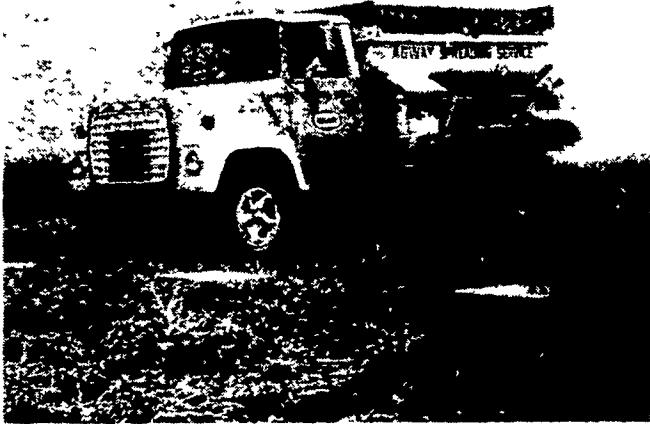
At Agway's Spreader Clinic held Thursday afternoon, trucks from 11 southeastern Pa. counties were inspected for safety and efficiency in spreading fertilizer.