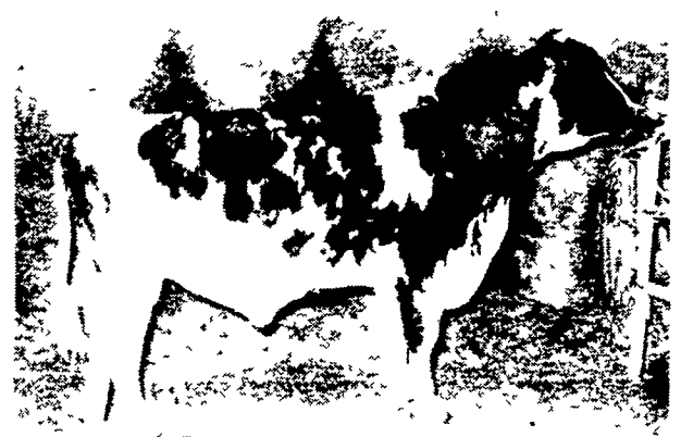
9A79 Mar Ral Fickle's BOY — EX 67 Daus in 40 Herds Ave 12 585M 3 80% 478F Pred Dif (75% rpt) +521M +$32 +13F 12 Classified Daus Ave 84 2 -1 2/Br Ave