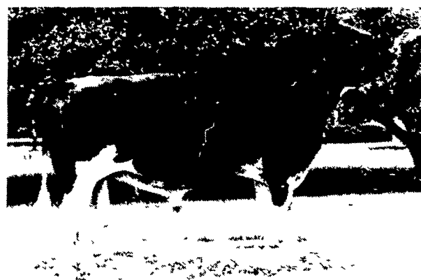
15H161 Kanawaka EDUCATOR — VG & GM 22 Daus in 4 Herds Ave 18 333M 3 79% 694F Pred Dif (34% rpt) +742M +$52 +26F 17 Pr Classified Daus Ave 83 8 +1 55 PDT