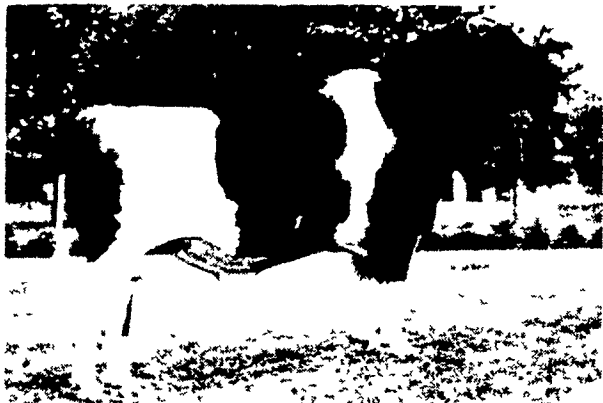
15H120 Harrisburg GAY Ideal — EX & PQ 222 Daus 127 Herds Ave 15 959M 3 62% 578F Pred Dif (91% rpt) +1 068M +$70 +32F 35 Cl Daus Ave 79 8, 24 Pr - 23 PDT