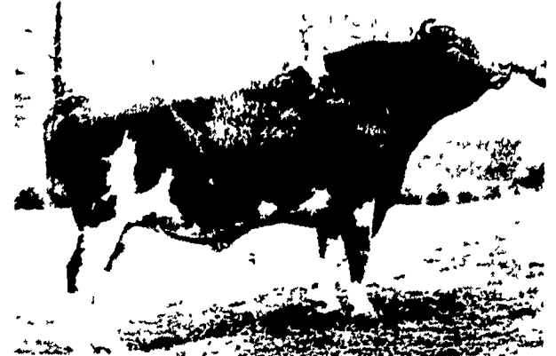
15G111 Nolichucky TC TRANSFER 10 Daus in 1 Herd Ave 15 137M 4 31 653F Pred Dif (19% rpt) +433M +$28 +12F 10 Classified Daus Ave 86 5 +3 5/Br Ave