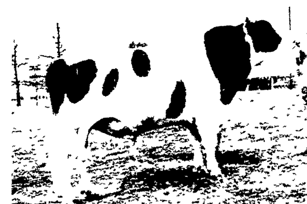
15H141 Sterlingdale PIONEER Admiral — EX & GM 29 Daus in 3 Herds Ave 18 587M 3 32% 618F Pred Dif (32% rpt) +780M +$37 +6F 25 Pr Classified Daus Ave 82 0, + 48 PDT