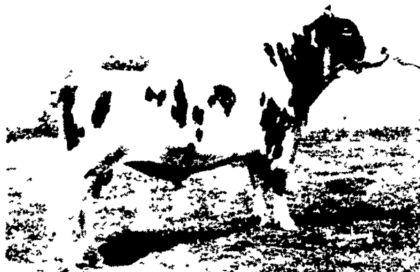
15H140 Round Oak ELECTRON — GP (preliminary USDA summary June/74) 21 Daus in 18 Herds Ave 17 636M 3 67% 648F Pred Dif (50% rpt) +933M +$62 +29F