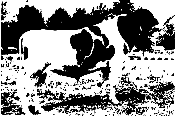
15H123 Whittier Farms Apollo ROCKET — GP & PQ 124 Daus 78 Herds Ave 16 795M 3 45% 580F Pred Dif (85% rpt) +1 728M +$95 +29F 28 Cl Daus Ave 78 3 23 Pr 37 PDT

All Plus-Proven And Available Daily For Your Dairy Herd: