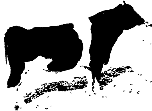
15H103 Penstate IVANHOE STAR — VG & GM 3 832 Daus 1 295 Herds 15 775M 3 73% 588F Pred Dif (99% rpt) +761M +$61 +36F 1 069 Cl Daus Ave 79 6 772 Pr + 19 PDT