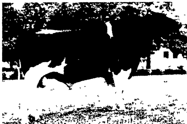
15H171 Minnechaug Glenafton HERCULES — VG & GM 22 Daus in 5 Herds Ave 19 634M 3 65% 717F Pred Dif (29% rpt) +624M +$40 +18F 29 Pr Classified Daus A DT