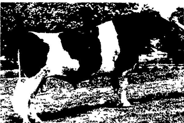
15H128 WINTERthur Hector Ivanhoe Van — VG & PQ 86 Daus in 62 Herds Ave 15 748M 3 77% 593F Pred Dif (79% rpt) +889M +$74 +45F (no official type summary to date)