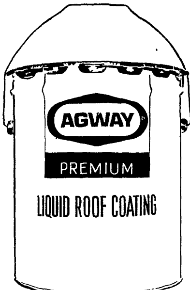
Premium Quality Aluminum Roof Coating