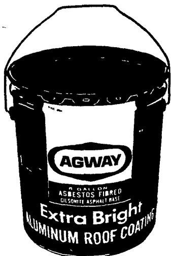
Extra Bright Aluminum Roof Coating