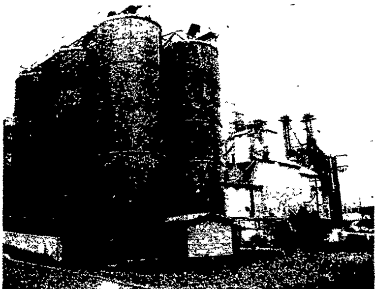
Harvester silos are used to store ingredients. Air-vayor system is used to fill and empty silos.