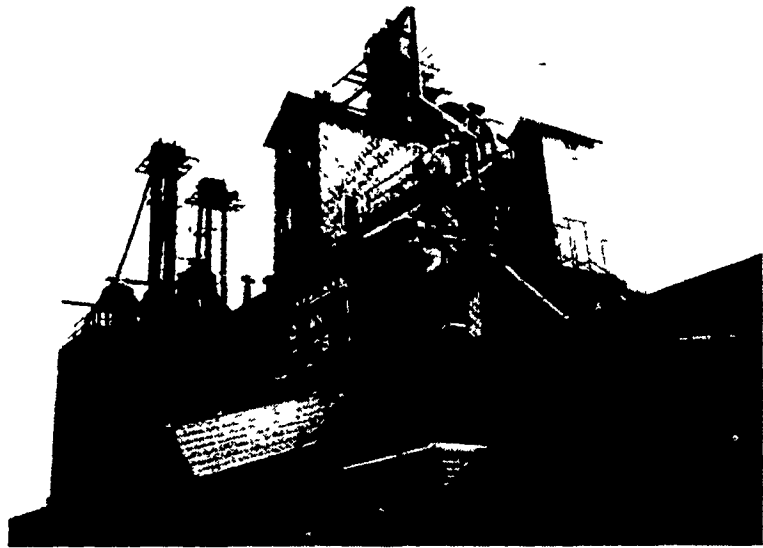
New Air-Vayor system triples bulk unloading facilities. Ingredients are delivered by either railroad or truck.