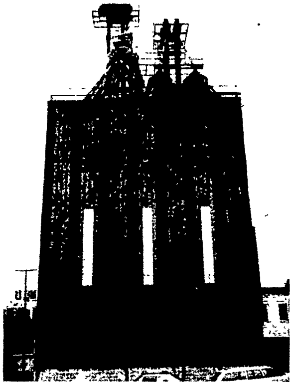
New bulk load-out facility includes 32 more bulk bins and a traveling scale. Saves load-out time and increases efficiency of feed mixing plant.