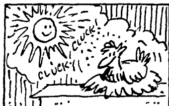
Some people believe that hens roosting early presages good weather.

Tuesday, Sept. 3 Total Head, 1106 SLAUGHTER STEERS: High Choice and Prime 46.75-47.75, Choice 44.00-46.75, Good 39.10-43.50. SLAUGHTER HEIFERS: Choice 39.00-40.25, Good 35.00-39.25. COWS: Utility 23.85-25.35, Cutter 22.85-24.00, Canner 20.00-23.25, Shells down to 15.00. BULLOCKS: Choice 32.00-34.75, Good 28.75-32.10, Standard. BULLS: 1-2 29.00-35.00. VEAL CALVES: Choice 70.00-80.00, Good 60.00-72.00, Standard 40.00-57.00, Utility 22.00-40.00, Utility 70-85 12.00-23.00. SHEEP: Choice 38.00-41.00, Ewes 12.00-18.00.