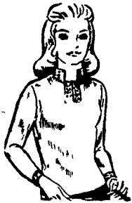
This knitted sweater features the popular Nehru collar. Directions for No. 165 are given in small, medium and large sizes.

Send 50¢ for each dress pattern, 30¢ for each needlework pattern (add 15¢ for each dress pattern, 10¢ for each needlework pattern for mailing and handling) to AUDREY LANE SU REAU, Morris Plains, New Jersey 07950