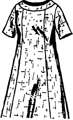
A princess lined dress with long or short sleeves or no sleeves at all features a scooped neckline that can be made with a yoke. No. 3393 comes in sizes 12 1/2 to 22 1/2. Size 14 1/2 (bust 37) takes 2 3/4 yards of 44-inch fabric.