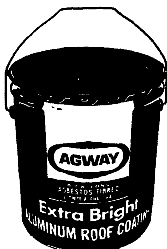
Extra Bright Aluminum Roof Coating

+ Available in galvanized and color + 30 inch coverage + 8 foot to 22 foot in even lengths