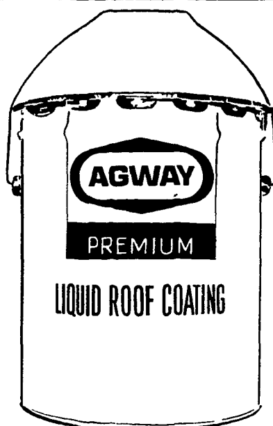
Premium Quality Aluminum Roof Coating