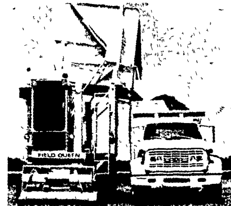
FQS - SIDE DUMP

GET MORE CAPACITY FROM YOUR FORAGE HARVESTER DOLLARS