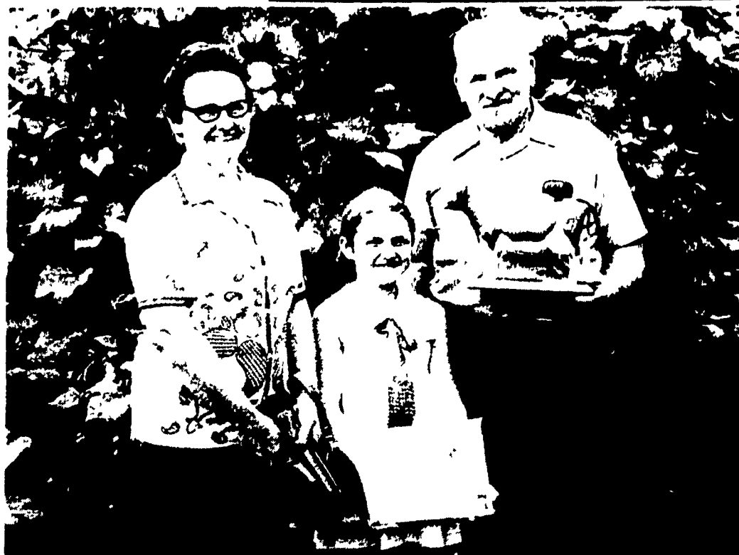
Judging contest winners at Tuesday's Lancaster County Guernsey Field Day proudly hold up their prizes. The winners, left to right, are