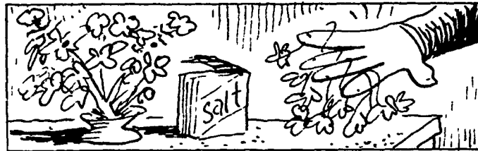
Some people say that buttercups mixed with salt and hung from the fingers will cure toothaches!

Meat pies are pies, of course, but they're also a stew. In fact, a good way to vary the second-day serving of stew is to place it in a pie or casserole, adding a different vegetable when necessary, then topping with pastry, biscuits, mashed potatoes, or cereal crumbs