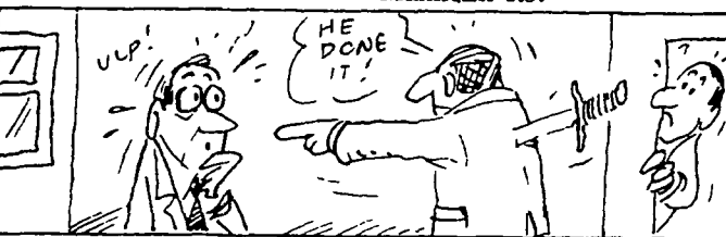
Some people still believe that a body will indicate its murderer.