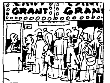
Cary Grant, whose real name is Alexander Archibald Leach, has made more than 70 movies, according to World Book Encyclopedia.

The American Farmer degree is based on the member's activities in FFA and their leadership abilities in either productive farming or agribusiness.