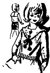
196 SAILOR SWEATER

A square necked beauty where the princess lines below the yoke are very gently fitted. No 3257 comes in sizes 12, 14, 16, 18, 20, 42, 44, 46. Size 14, sleeveless, takes 2½ yards of 44-inch fabric; with short sleeve, 2¾ yards of 44-inch.