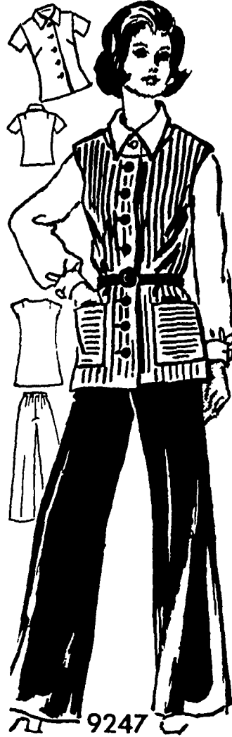
9247 SIZES 10½-18½

Printed Pattern 9247: Half Sizes 10½, 12½, 14½, 16½, 18½. Size 14½ (bust 37) blouse 1¼ yards 45-inch, jacket 1½, pants 2¼ yards