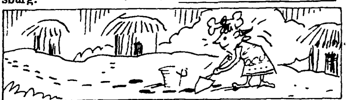
Zuni Indian women sometimes keep the soil of their husband's footprints to keep them faithful!