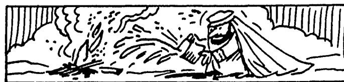
Some Arabs believe that a heavy downpour can be stopped by quenching a fire with water.

Most car makers provide plastic looms that secure the plug wires to the rocker cover. These help maintain the proper wiring arrangement and prevent the wires from being burned on the hot exhaust manifold. Should these looms be damaged or lost, they should be replaced as a further guard against crossfire.