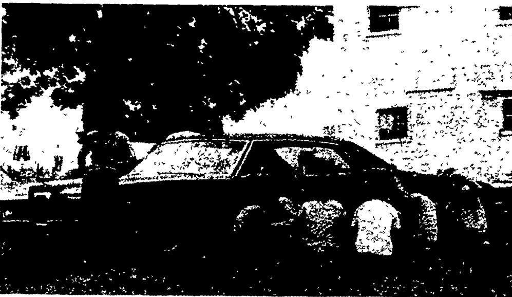
Part of the work crew at the Funk corn research laboratory pausing for a bite of lunch.