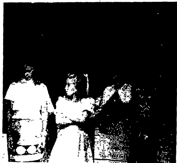
The first year cooking club members impressed the audience with their know how on cooking brownies in an original skit. The Club included the only boy member.