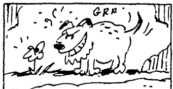
Foiget-me nots are said to cure the bites of snakes and mad dogs!

FEEDERS: Three loads Choice 918 pound steers 40.50, few Good and Choice 735-828 pound steers 33.00-36.00.