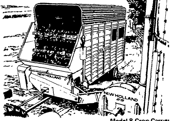
Model 8 Crop-Carrier