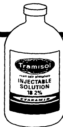
Takes the guesswork out of worming

Write or Call for a list of Local Dealers