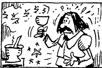
Medieval healers claimed that gold fused under certain astrological signs could cure appendicitis.