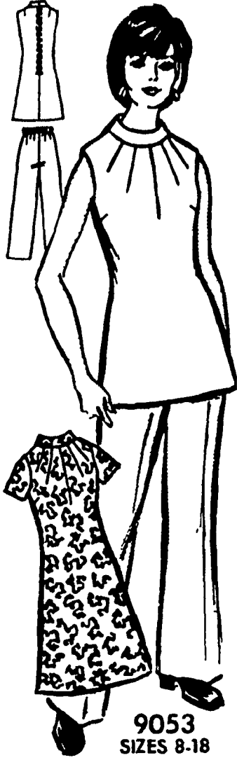
9053 SIZES 8-18

Printed Pattern 9053: Misses' Sizes 8, 10, 12, 14, 16, 18. Size 12 (bust 34) pantsuit 3 3/4 yards 45-inch fabric