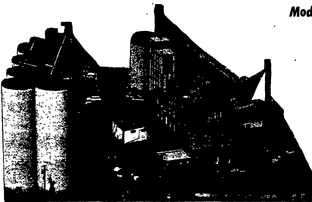
Grain Elevator, Feed Warehouse & Flour Mill, Fleetwood, Pa. (6 miles Northeast of Reading off Route 222)