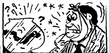
Some people believe that eating eels will cure toothache.

Oil In The British Sphere Oil was found in Brunei, a sultanate on the island of Borneo in 1929. Today, only Nigeria and Canada pump more oil, among oil producers in the British sphere. All Brunei's production of liquefied natural gas for the next twenty years—five million tons annually—will go to Japan.