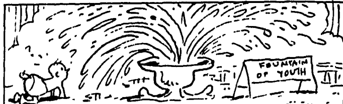
It was once believed that there was a fountain of youth in the Bahamas.