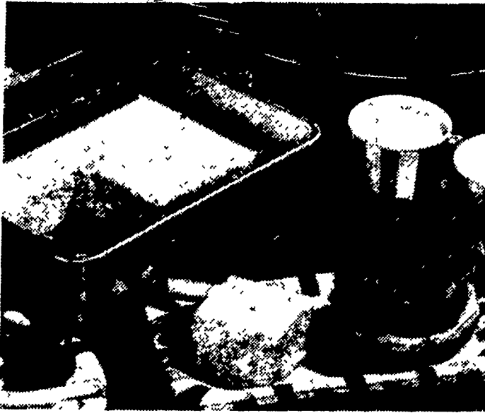
Pineapple and bits of grated Cheddar cheese make golden highlights in this pale green salad that also contains cream cheese, cottage cheese and dairy sour cream in a blend of lemon and lime gelatins. Great carry-along picnic fare.

If you're planning a picnic for a group and want to serve a special salad, this pineapple and cheese mold will be a big hit at the beach, the park or on the deck of your boat. It serves a crowd of 20 and can be made in a covered pan for carry-along