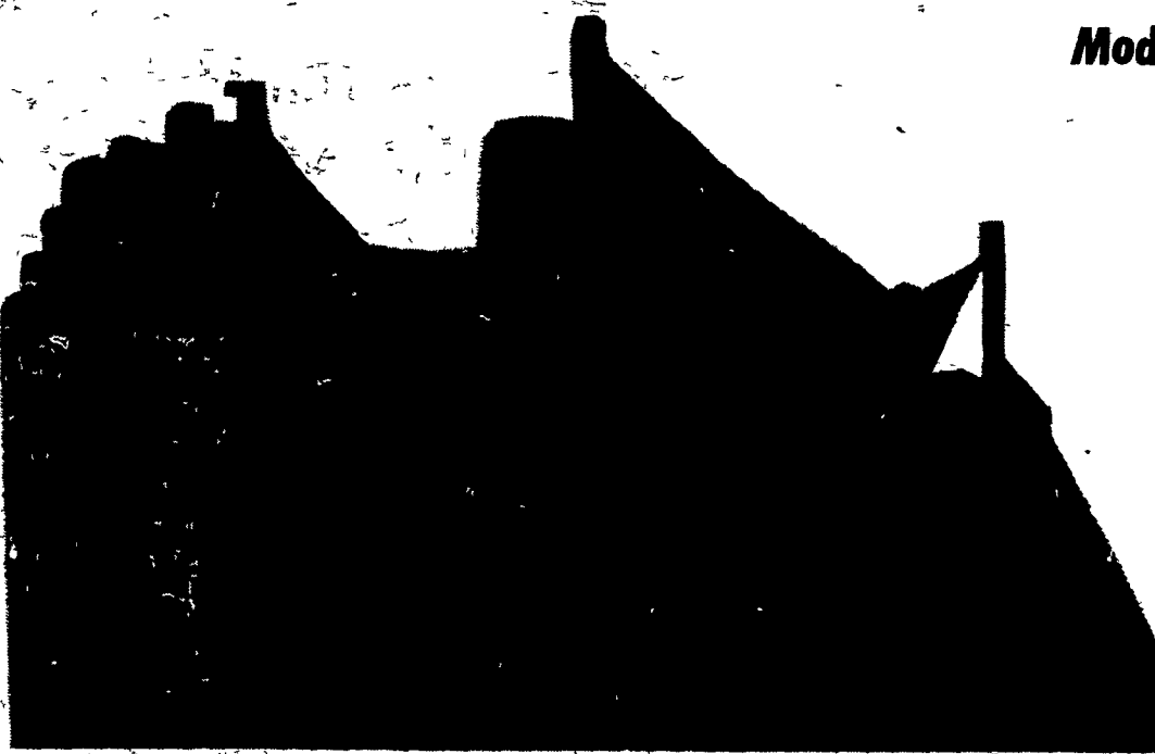
Grain Elevator, Feed Warehouse & Flour Mill, Fleetwood, Pa. (6 miles Northeast of Reading off Route 222)