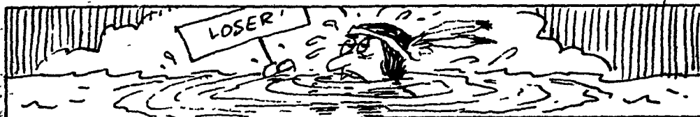
North American Indians have walking-on-water contests. They're hard to win, and even harder if you lose!