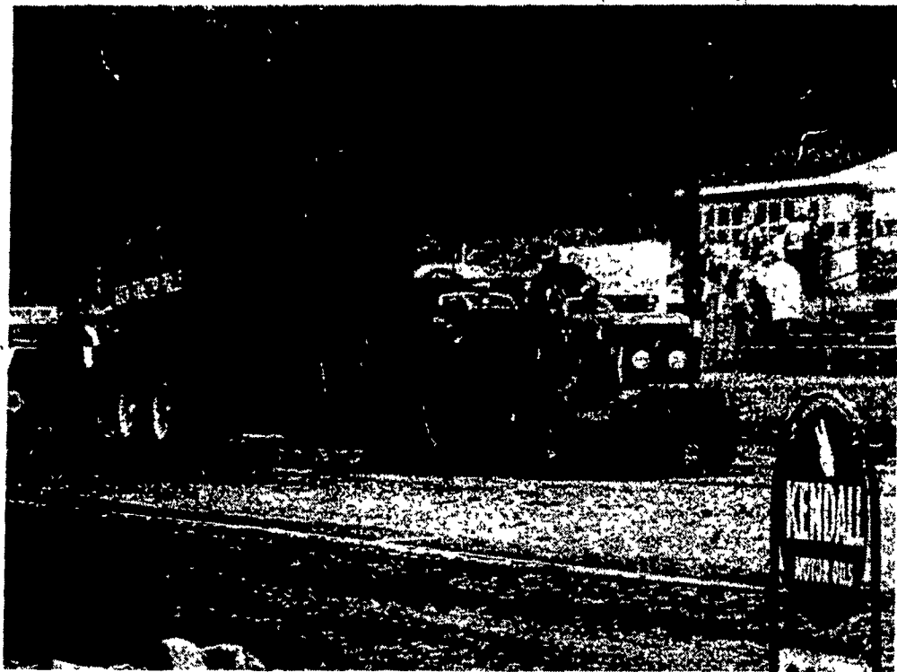
Nevin Ament, Ephrata, is shown roaring down the track during last

9000-pound Modified 1st - Paul Bosse, Findlay, Ohio W9-446 Lincoln; 2nd - Banter Bros., LaFontaine,