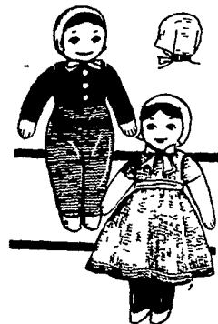
These adorable knit dolls will delight any child and you'll find them very easy to knit with Pattern No 1029.

Send 50¢ for each dress pattern 30¢ for each needlework pattern (add 15¢ for each dress pattern, 10¢ for each needlework pattern for mailing and handling) to AUDREY LANE BU REAU, Morris Plains, New Jersey 07950