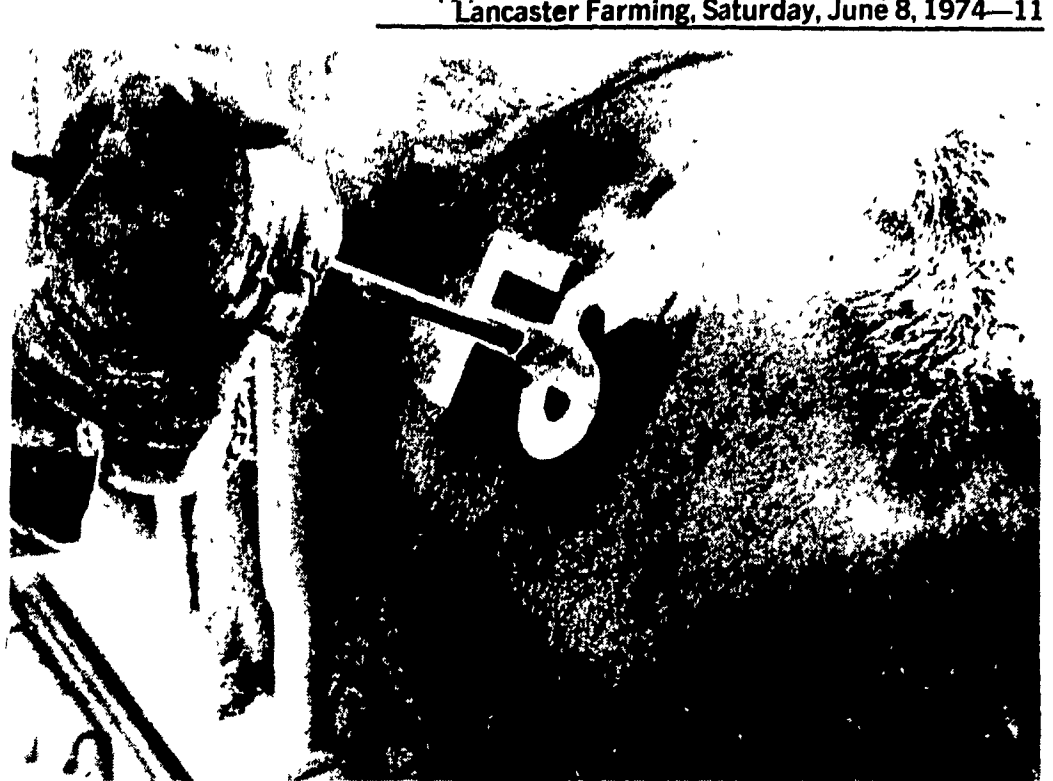
Frost, not smoke, is the stuff you see when cattle are freeze branded. The "FS" being applied to this steer's hide stands for Farm Show. Penn-