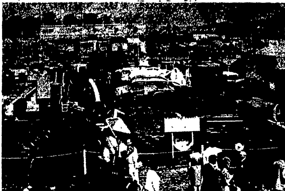
Shown above is some of the farm equipment displayed at last years Royal Agricultural Show in Great Britain. This year seven governments will stage displays of their products.

The 612 acre site (240 hectares) situated in the centre of the country is easily accessible from all parts by rail, road and air. It is a picturesque part of the country close to Stratford-upon-Avon, famous birthplace of William Shakespeare, near to the ultra-modern cathedral in Coventry and the ancient castles of Warwick and Kenilworth.