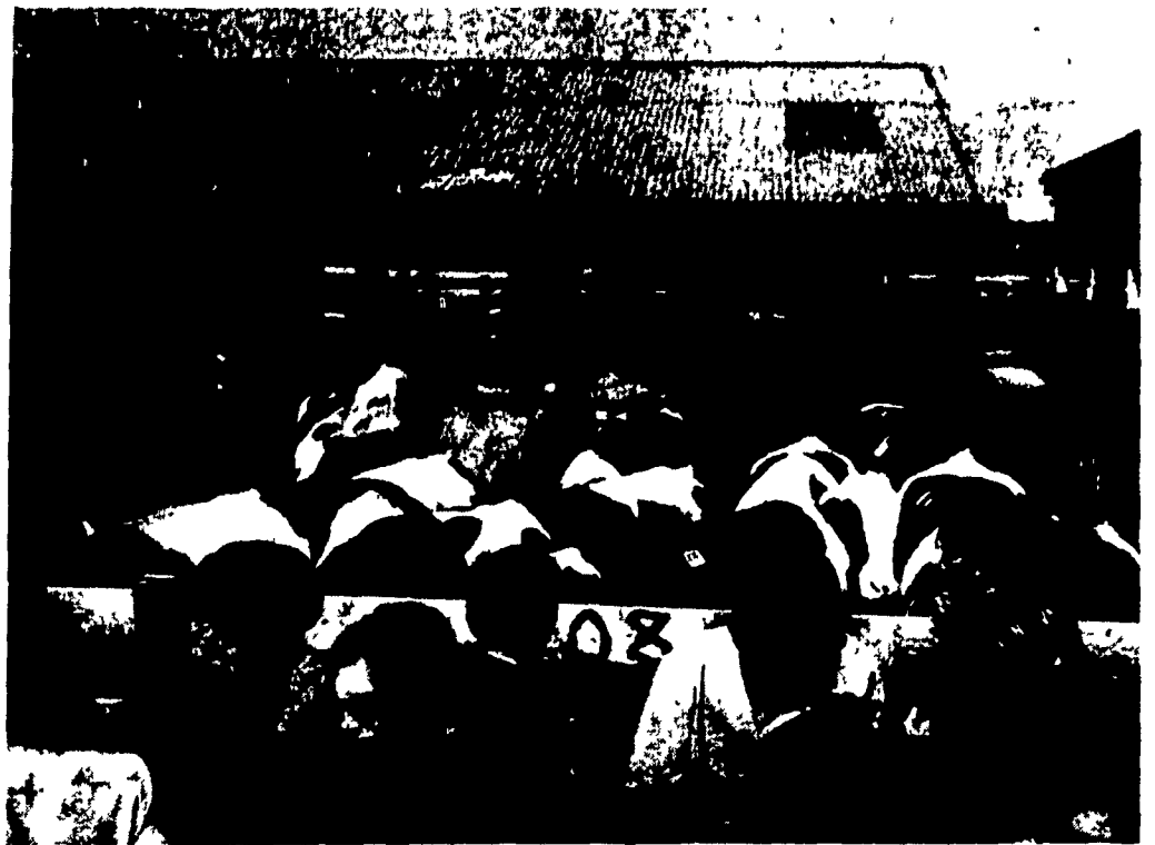
Mansfield and Grassland FFA members observed livestock at Lancaster Stockyards last week during a tour by the Mansfield group

The first stop scheduled for Tuesday May 14th was a tour of the Lancaster Stock Yards. Business was relatively slow but the