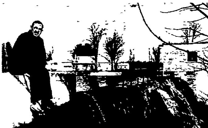
SITTING PRETTY is Lawrence Smith, 58, of North Windham, Mass., an electrician, who 5 years ago, built his own Hydro electric power plant. Spending 4 to 5,000 dollars, Smith, constructed a 15 ft. high dam across the outlet of Little Sebago Lake, complete with power house and turbine that delivers 25 kilowatts an hour; that is more than he uses in his all electric home in the background. Running now for some 5 years, Smith says, "when you have your own powerhouse, you tend to leave the lights on".

cattle and calves 1.00-2.00 lower with Good Grades 2.50-3.50 lower; Choice 600-900 pound feeder steers held up best and these mostly 1.00-1.50 lower. Cows recovered the early losses with closing sales near steady; Bulls 50 cents to 1.00 higher. Salable receipts near 21,500 head compared to 20,422 last week and 15,015 the comparable week a year ago. Cows nine percent of the cattle receipts; feeders 90 percent of the total.