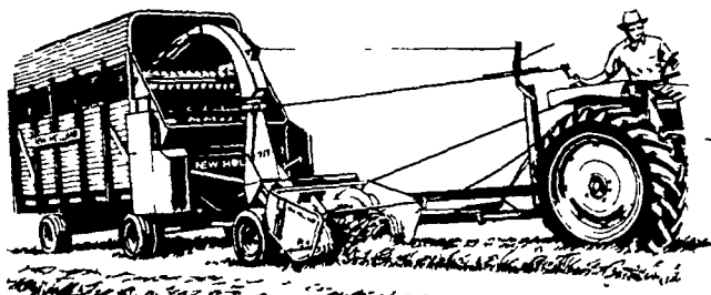
New Holland Super 717 with Windrow Pickup

AUTHORIZED DEALERS FOR ALLIS CHALMERS & NEW HOLLAND FARM EQUIPMENT