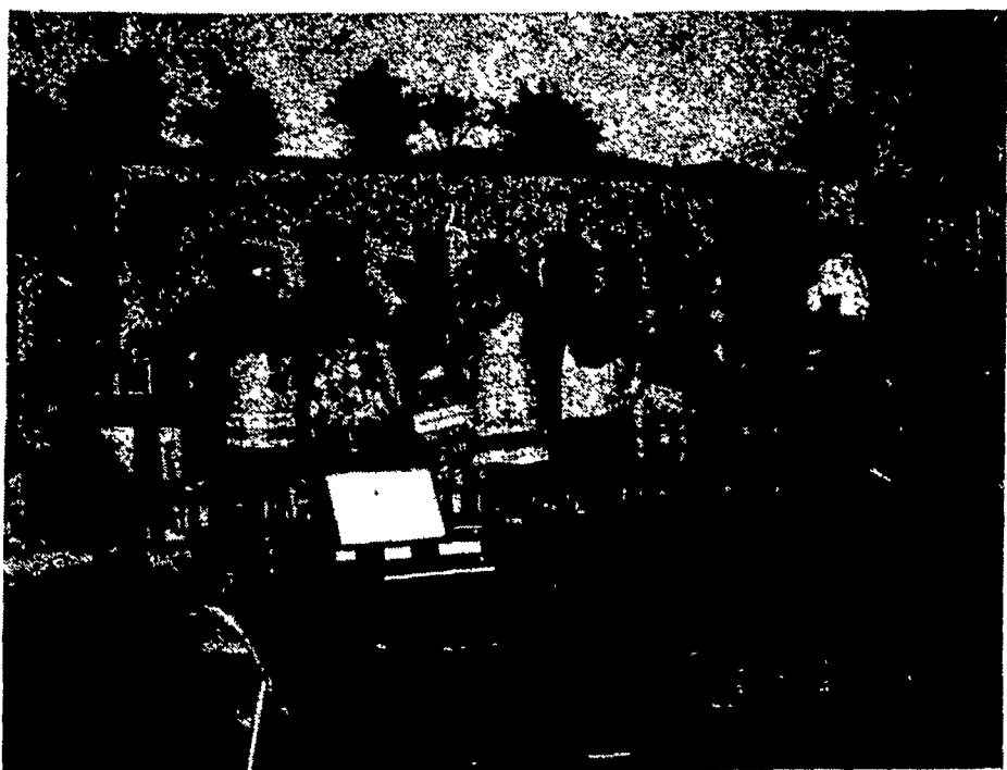
A kitchen band performing for Ladies Night during the Lecturer's program.

Theme - Serving The Community shows the Fulton Grange reaching the community through Agriculture, Legislation, Charity, Boy Scouts, Etc.