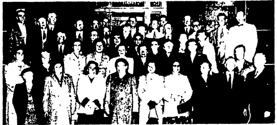
Fulton Grange group in front of Pa. State Grange Building Oct. 13, 1953