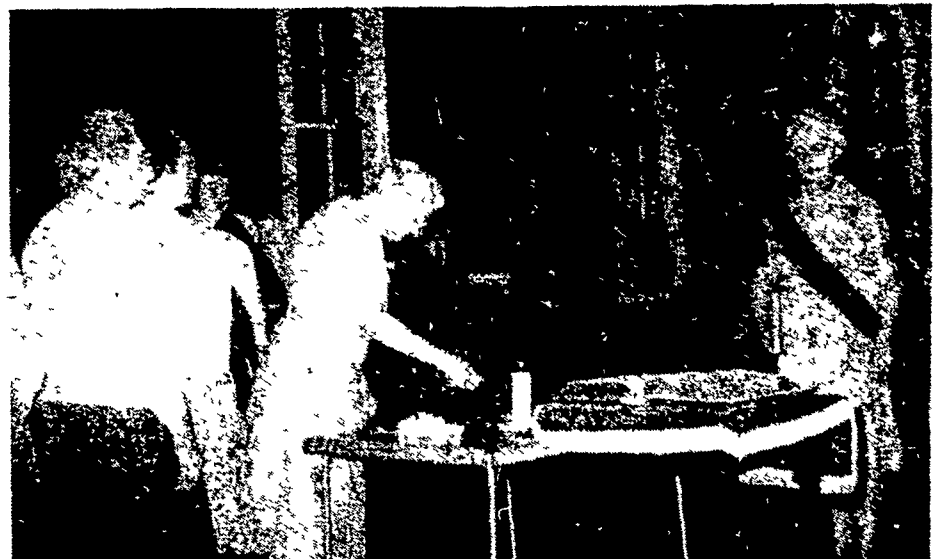
Mortgage Burning Ceremony - 1965